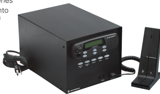
Control Station (RLN5403A) and Desktop Microphone (RMN5068A), shown with a CDM1250, all sold separately.

The CDM Control Station converts a CDM Professional Series mobile into a convenient base station. The radio mounts into the lightweight, portable chassis, containing a full range of front panel control buttons plus an internal microphone, speaker and power supply. A front connector allows for a range of external audio accessories; including a desk microphone, tone or DC remote adapter and telephone interconnect. Additional desktop tray and microphone options are available for simple base station operation.